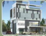
HSR People's Paramount