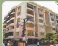
HSR Sri Sai Sushra Residency