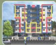
HSR Anuja Residency