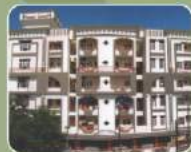
HSR AK Sai Souda