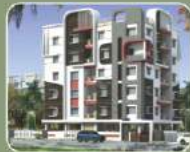
HSR Vankata Rama Serenity