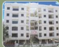
HSR Om Shanti Nivas