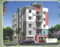
HSR Sai Nilayam