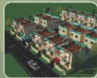
HSR Sarala Devi Enclave