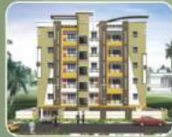
HSR SR Nilayam